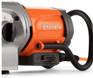
Sturdy and durable

Want to take a closer look? Learn more about the product in depth by exploring its features and benefits.